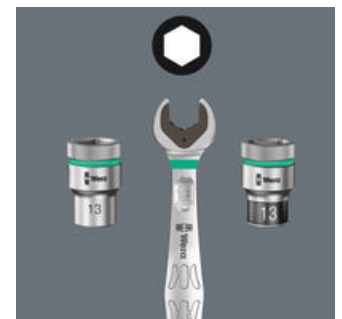
"Take it easy" tool finder

Take it easy tool finder system - with profile and size colour-coding for quick and easy tool selection. Colour-coded system for hexagon drive screws (L-Keys, Zyklop bit sockets), external hex drive screws and nuts (Joker wrenches, Zyklop sockets and Zyklop bit sockets with holding function), and TORX® drive screws (L-Keys, Zyklop bit sockets).