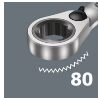
Fine tooth mechanism

The ratcheting feature at the ring end boasts an exceptional, fine tooth mechanism - 80 teeth in all - which provides greater flexibility, even in very confined workspaces.